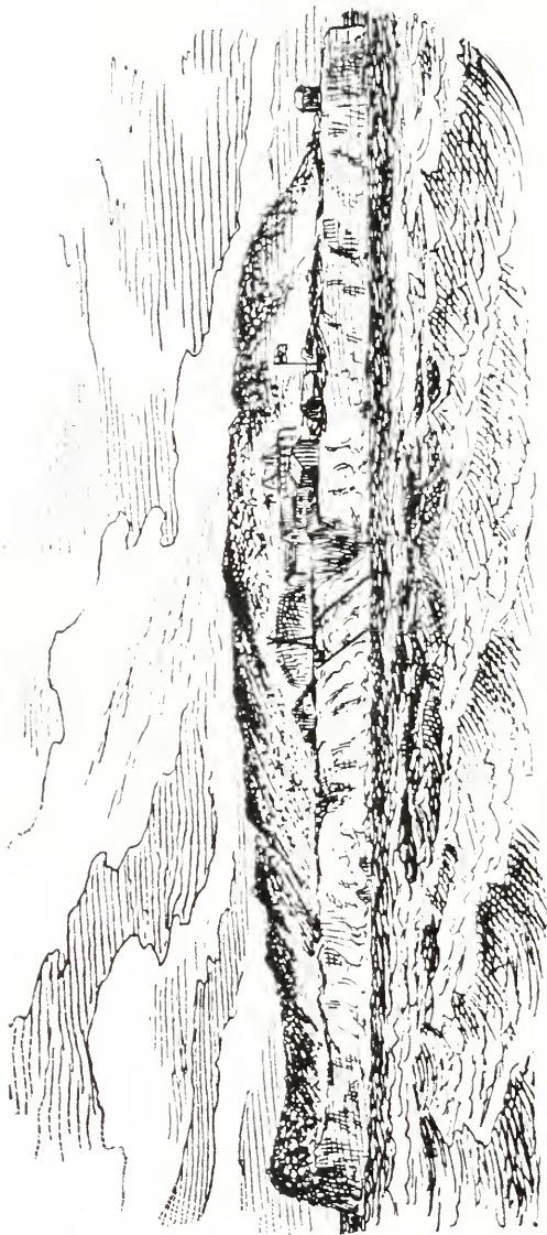
ISLAND OF NAVASSA.